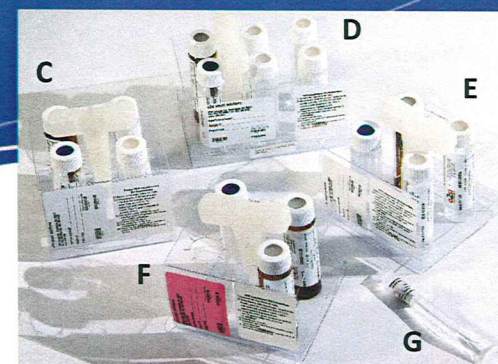
A. Low-Level clear vials B. High-Level amber vials C. Econo H 2 O Kit D. Econo 6-hole H 2 O Kit E. Econo Bisulfate Kit F. Econo VPH Kit G. smart delivery MeOH PFA tube